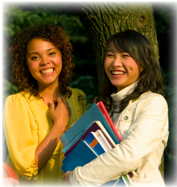
GIFTS ARE LAGGING, AND THIS MAY FORCE A CUT NEXT YEAR.