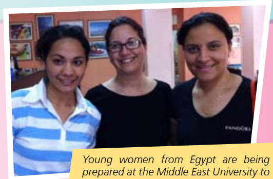
Young women from Egypt are being prepared at the Middle East University to go back and serve the Church in Egypt.

This group includes young women from very poor families, mothers, orphans, and widows. They are excellent students, hard workers, and dedicated leaders. Taking inspiration from our sisters, let us join them in blessing others.