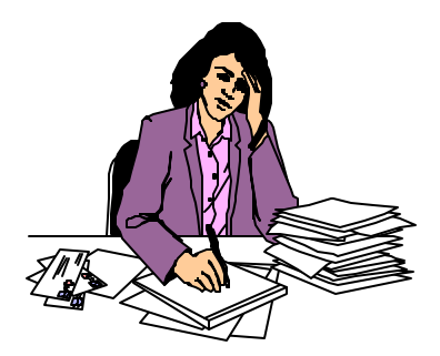
be thought out anyway.

The good news is that money is available. The bad news is that writing a proposal takes some time and effort. If you have not had experience writing proposals, you can ask your local ADRA director for help. Very often, ADRA can even help you get funding. In some areas of the world, the Office of Global Mission would also be a source of money.