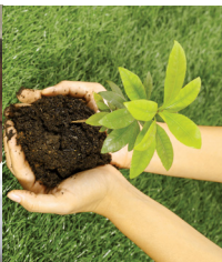
PLANT A SEED MINISTRY