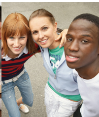
FRIENDSHIP EVANGELISM MINISTRY