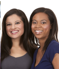
MY SISTER, MY FRIEND MINISTRY