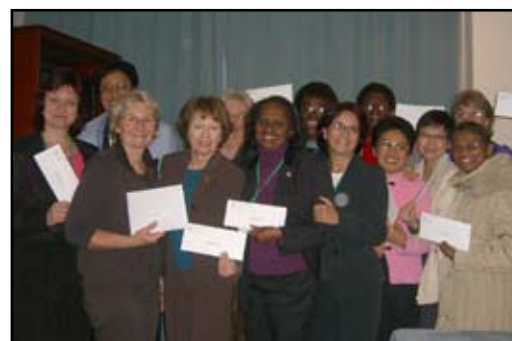
WM Directors receive letters with scholarship news.

Because of you, these talented women will reach their goal of completing college. You are supporting wonderful dreams and making our world better.