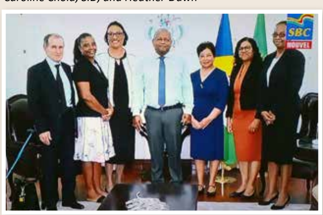
Visiting the president of the Republic of Seychelles, SID