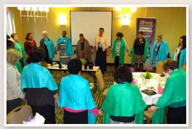
WM Advisory prayer circle, 2016