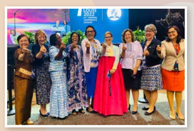
GC Session 2022 with WM division directors